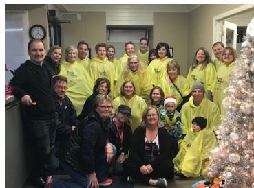
Victorian Order of Nurses